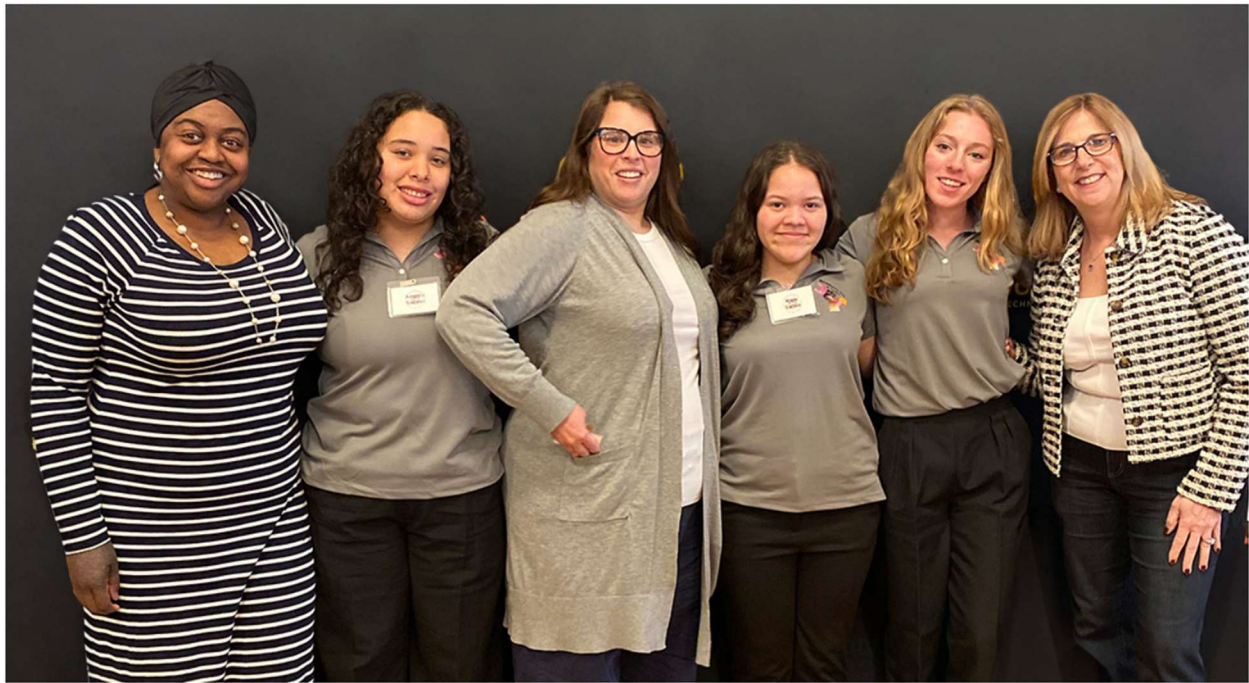
Massachusetts Girls in Trades Leadership & State Officers at the Women in Wentworth Event in March.